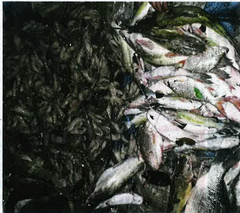
Pencemaran Sungai Sembrong menyebabkan ribuan ikan air tawar dan udang galah mati.

Halim berkata, pihaknya bimbang pencemaran itu akan menyebabkan sumber ikan serta udang galah sungai berkenaan berkurangan dan ia memerlukan tempoh masa yang lama untuk kembali pulih bagi membolehkan aktiviti perikanan dilakukan semula.