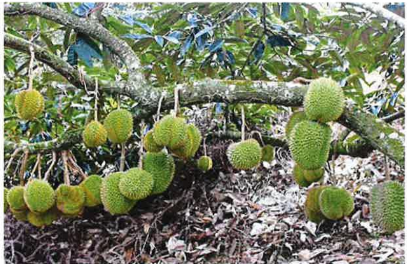
Federal Agricultural Marketing Authority expects durian harvest to fall to below 300,000 tonnes in the current season due to the high rainfalls and lack of manpower.

"To ensure that our customers receive the best quality fruits, we collect the durians from the farm in the morning, repack them into boxes and deliver them on the