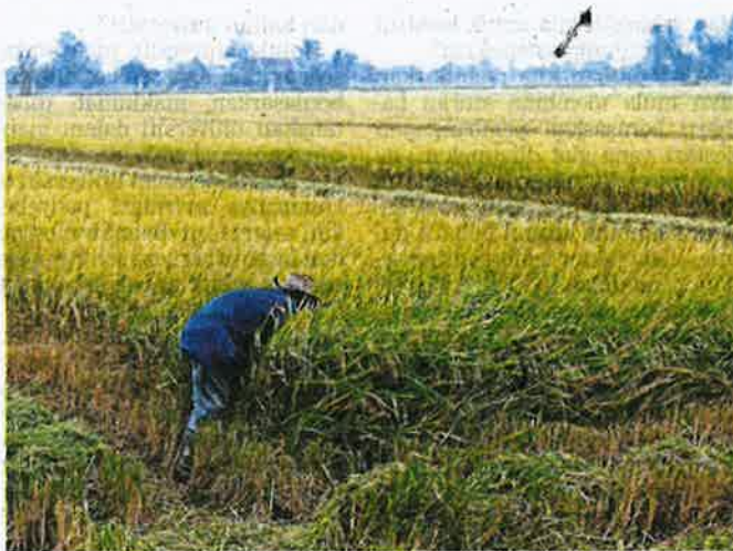
Sektor pertanian perlu dinilai semula dan dikembangkan agar mampu bekalkan makanan kepada penduduk negara ini. (Foto hiasan)

Kini Malaysia melangkah ke hadapan dengan berkembangnya