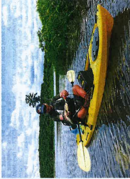
Solo sport: A file picture showing an angler on a single-seater kayak holding up a giant snakehead fish.

"If you live near a body of water, go ahead by yourself and cast your line from land. Enjoy your recreation again, but otherwise be patient until we have Covid-19 fully in control," she said.